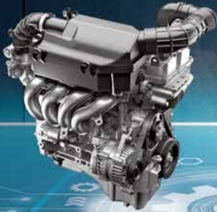
K-SERIES 1.2L ENGINE