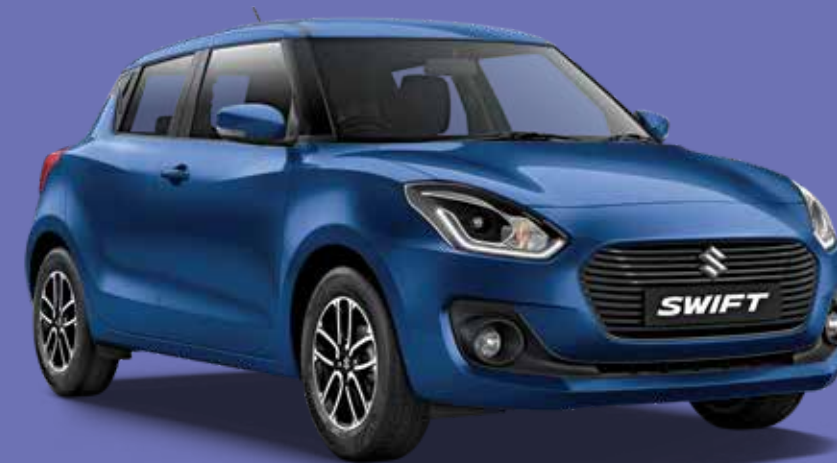
Pearl Metallic Midnight Blue