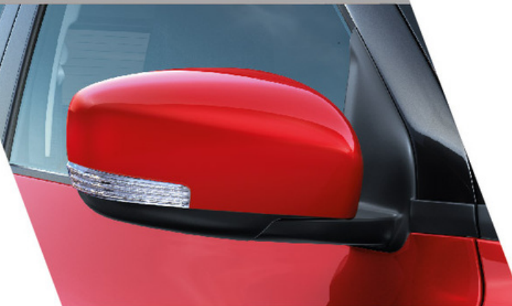
Electrically Foldable and Adjustable ORVMs with Turn Indicators

The Signature LED Daytime Running Lamps (DRLs) paired with LED Projector Headlamps and auto lighting mechanism lends Swift the confidence to be unstoppable. The Aggressive Front Grille and the Muscular Front Fascia amplify its overall active and dynamic personality.