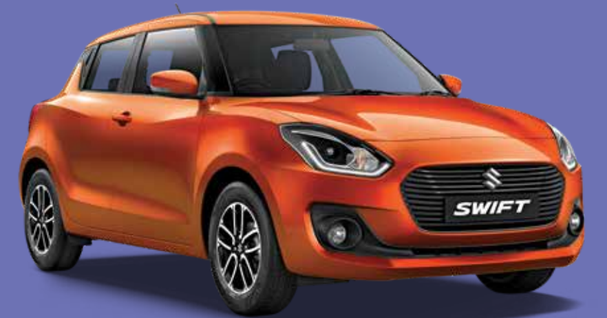
Pearl Metallic Lucent Orange