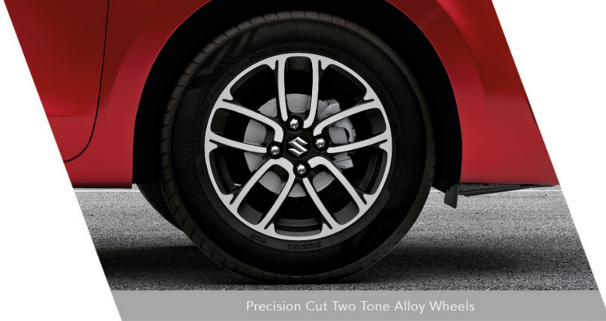
Precision Cut Two Tone Alloy Wheels