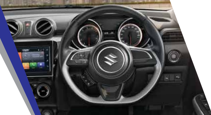
Leather* Wrapped Steering with Flat Bottom Design