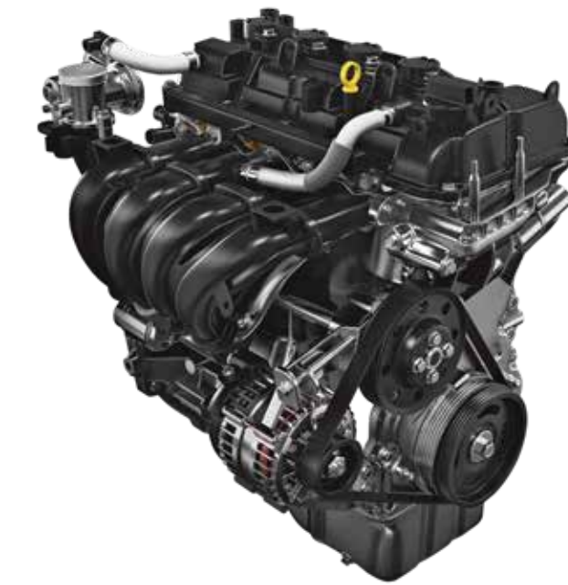
1.2 L VVT Engine

The powerful VVT Petrol Engine in the Swift is engineered to deliver an unmatched driving experience. The performance delivered by the powertrain makes the Swift a machine that's capable of outperforming every challenge, every time.