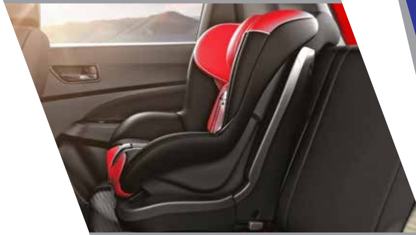
IsoFix with Child Seat Restraint System