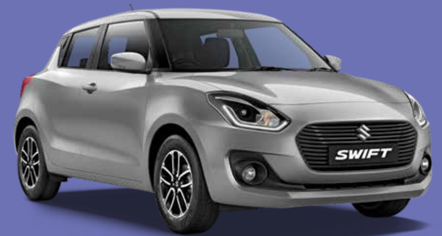
Metallic Silky Silver