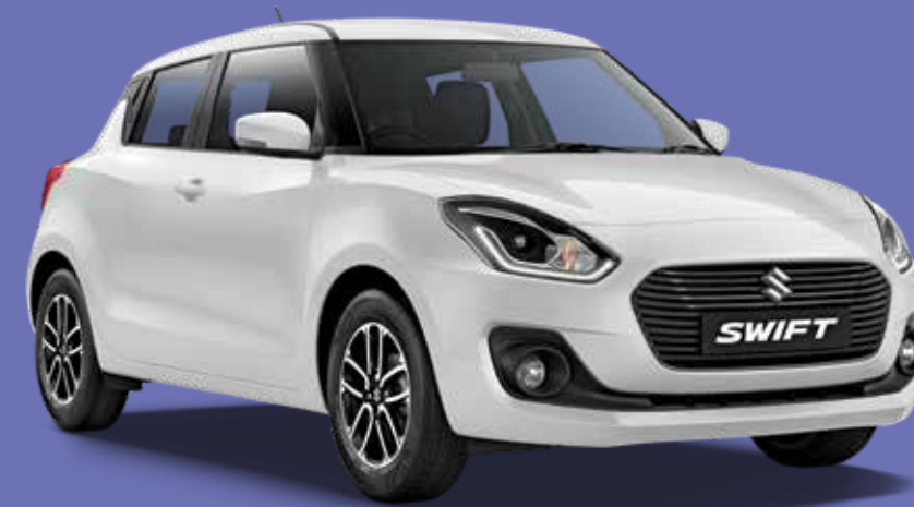
Pearl Arctic White