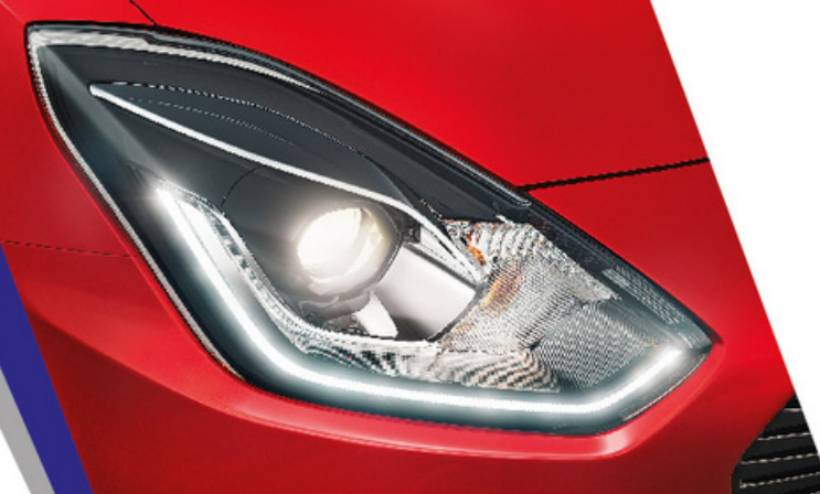
LED Projector Headlamps with DRLs