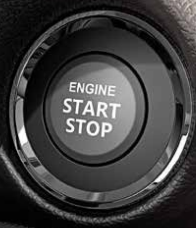
Push Start-Stop Button