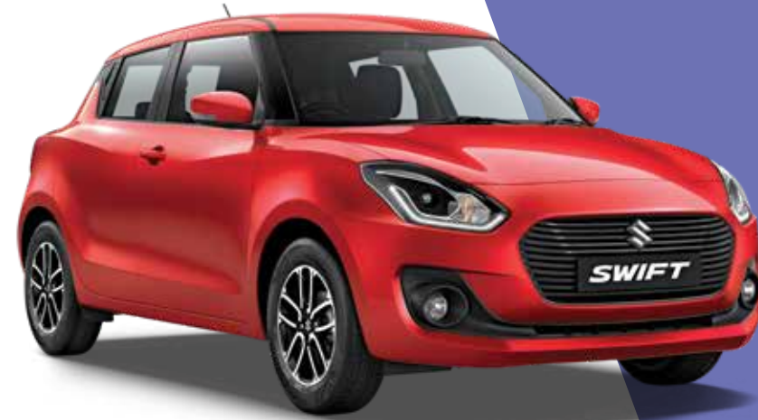
Solid Fire Red