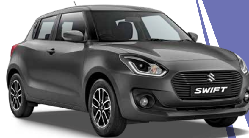
Metallic Magma Grey