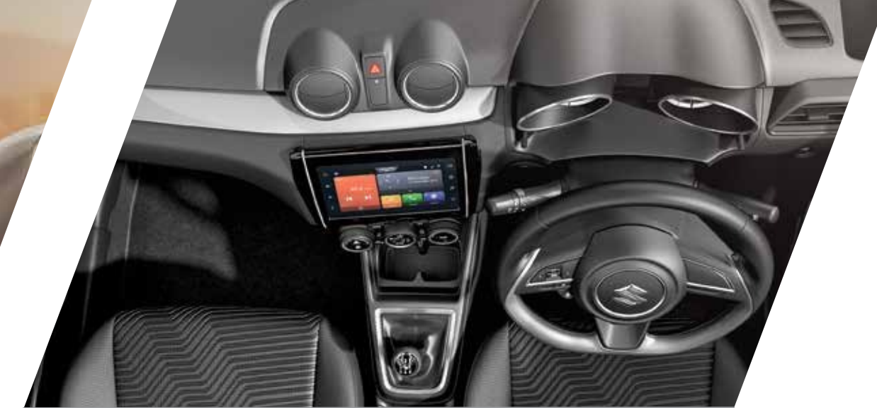
Driver Oriented Cockpit Design