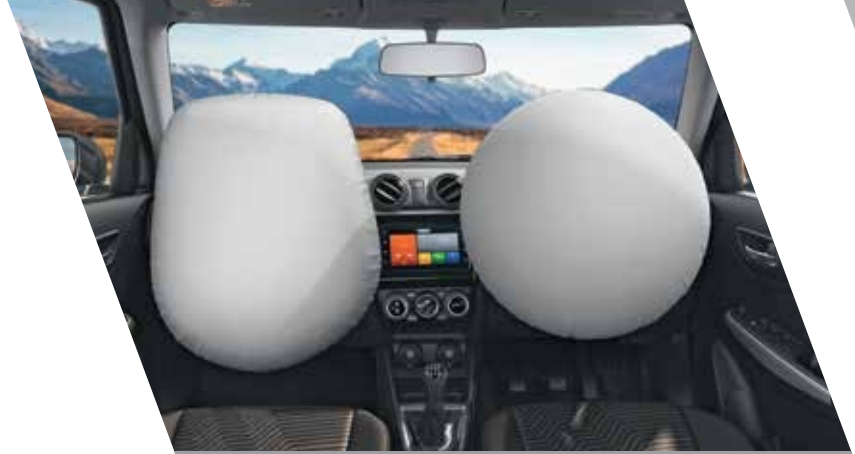
Front Dual Airbags

From Dual Front Airbags to ABS with EBD, the Swift packs a host of safety features that make sure it's always ready and secure. The all-new Heartect Platform employs High Tensile Steel at all the right places to improve the overall safety, rigidity and NVH performance of the Swift.