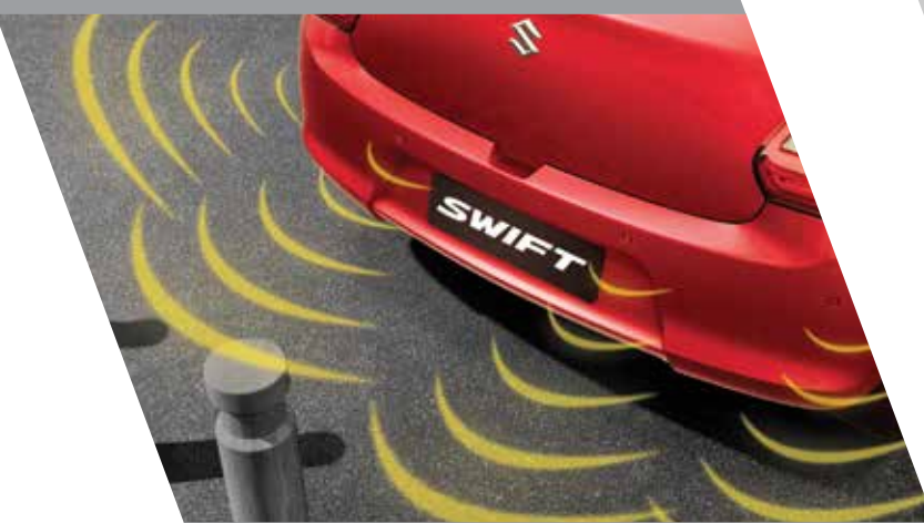
Reverse Parking Sensors with Camera