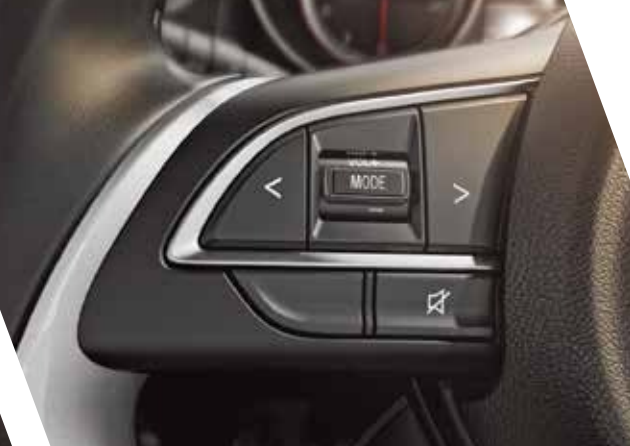
Steering Mounted Audio Controls