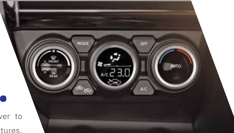
Automatic Climate Control