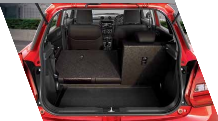
Expanded Boot with 60:40 Split Rear Seat