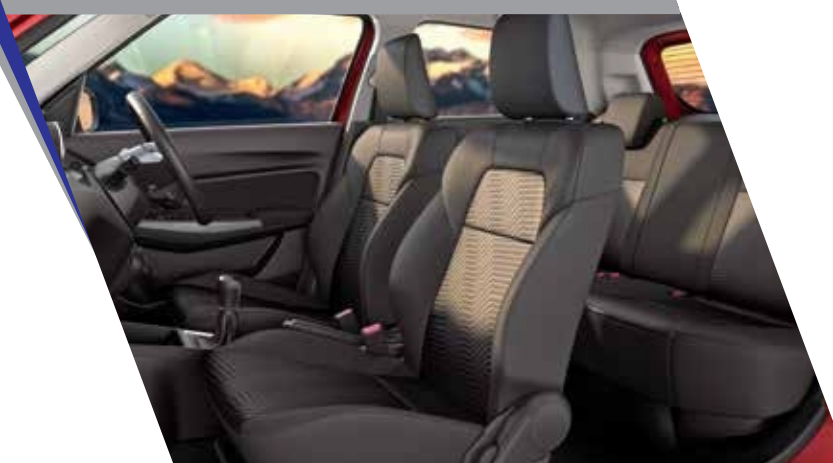
Bolstered Seats for Enhanced Comfort